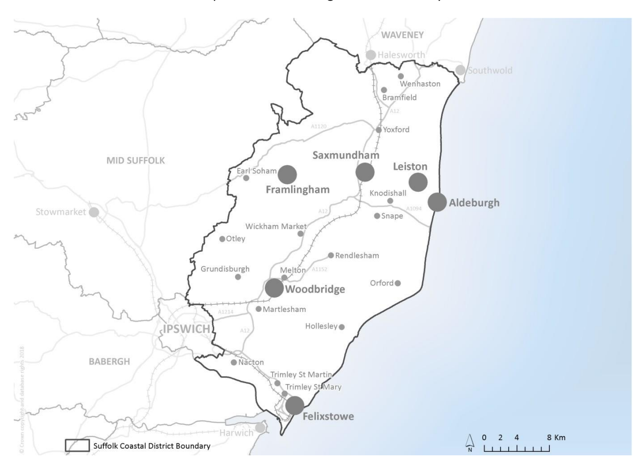
Suffolk Coastal District

The district council is preparing a new Local Plan for the district which provides a vision for the communities of Suffolk Coastal up to 2036 and recognises the diversity of the area.